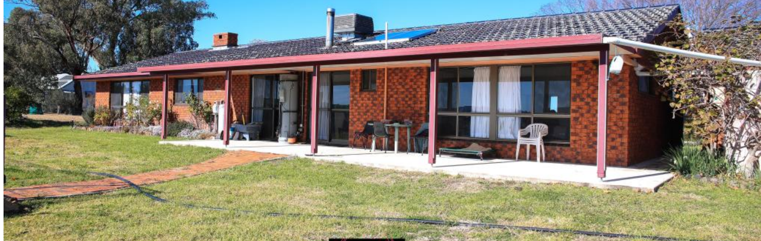
Byron Park, Toms Dr, Inverell