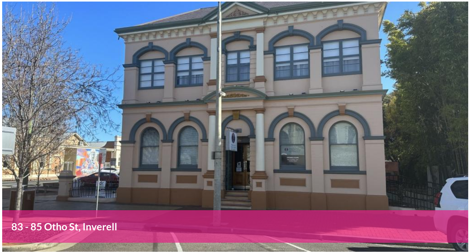
83 - 85 Otho St, Inverell