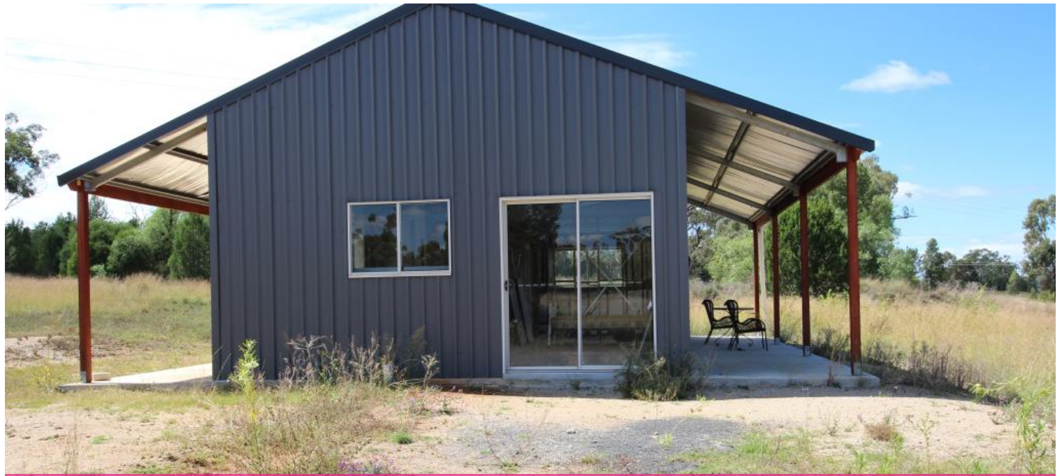
3 Acacia Crescent, Warialda